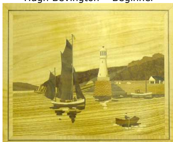
Hugh Bevington - Beginner