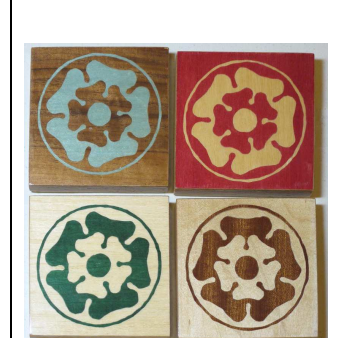
Norman Ward - Intermediate

CALENDER PROJECT – We need you to bring in items for high resolution photographs – details overleaf