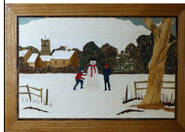
Rachel Nelson - Intermediate